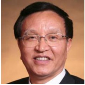
Mr. Zhang Guobao (China)

Former Director of China's National Energy Administration