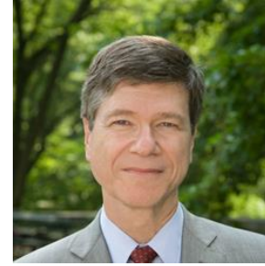
Dr. Jeffrey Sachs (USA)

United Nations Under- Secretary-General for Economic and Social Affairs