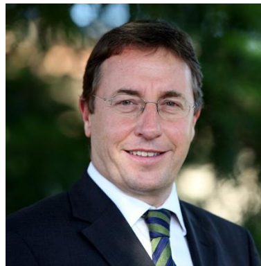
Mr. Achim Steiner

Deputy Chairman and Secretary General of China Energy Fund Committee