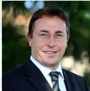
Mr. Achim Steiner

72nd President of the United Nations Economic and Social Council