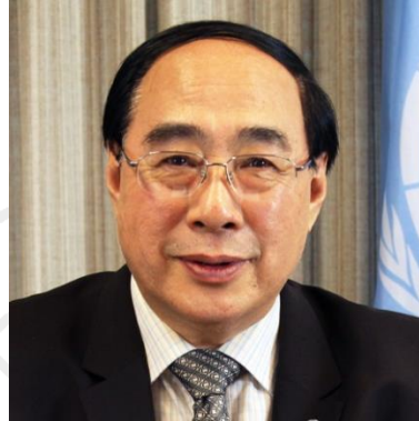
H.E. Mr. Wu Hongbo

President of the 71st Session the United Nations General Assembly