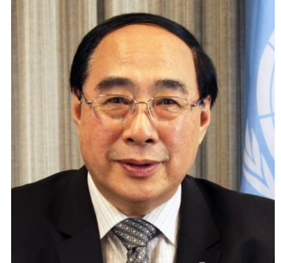
H.E. Mr. Wu Hongbo

70th President of the United Nations Economic and Social Council