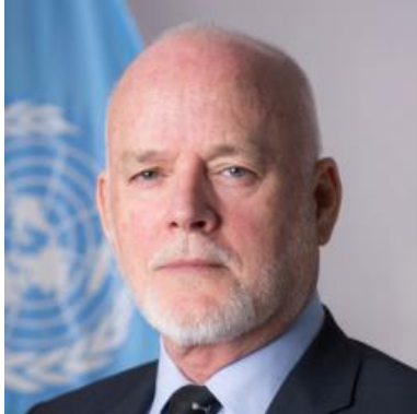
H.E. Mr. Peter Thomson

President of the 71st Session the United Nations General Assembly