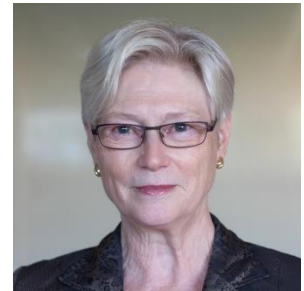
Ms. Maria van der Hoeven (France)

Honorary Executive Director at The Energy and Resources Institute