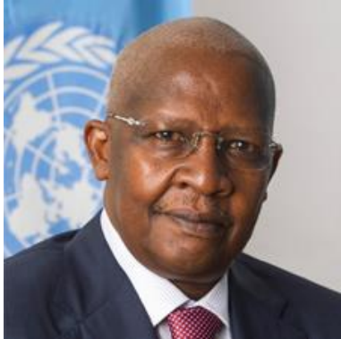
H.E. Mr. Peter Thomson

President of the 71st Session the United Nations General Assembly