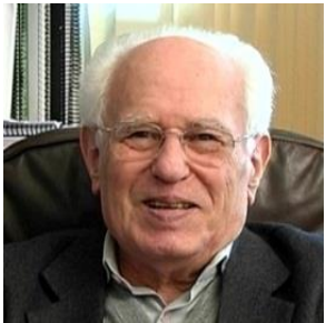
Dr. José Goldemberg (Brazil)

Founder & Chief Executive of Citizens for Affordable Energy, Former President of Shell Oil Company